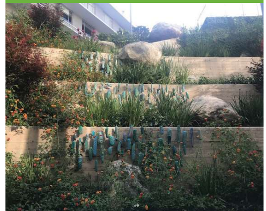
CASCADE, an abstract waterfall sculpture by local artist Leo Bersamina.