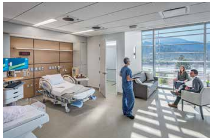
One of our spacious maternity LDRP rooms