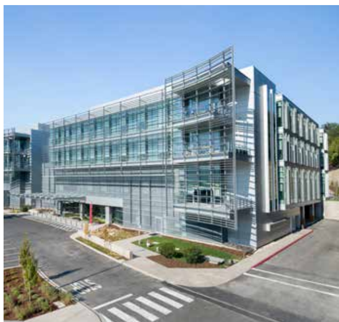
Exterior view of the Emergency Department