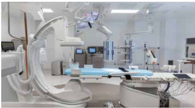
Multiplatform procedure room