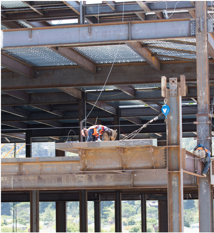
Construction workers hard at work.

Where medically appropriate, minimally invasive surgical approaches are fast becoming the standard of care. In keeping with this sweeping change, surgery will expand to include three dual-use interventional suites for electrophysiology, catheterization, and interventional radiology. Three new operating rooms are being built, in addition to eight currently in use in the West Wing. The hospital is also adding 18 pre-op and 17 post-op rooms.